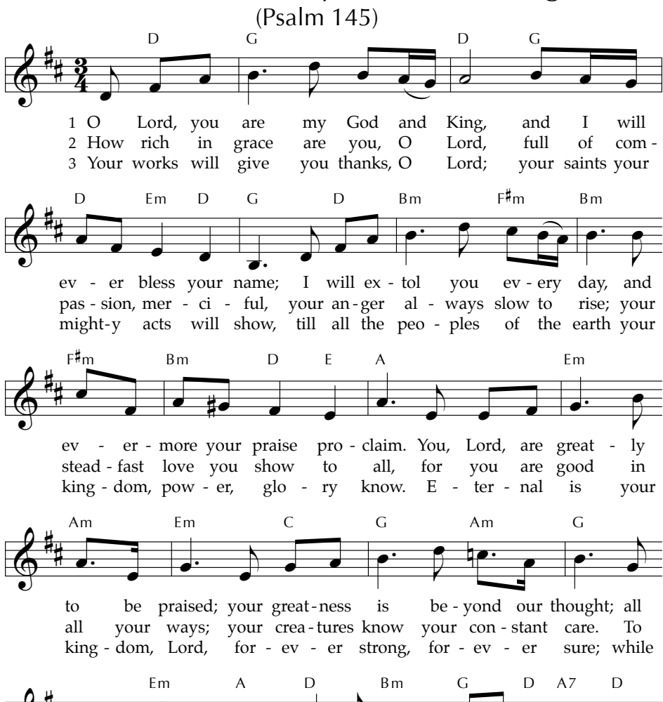
gen-er - a - tions shall tell forth the might-y won-ders you have wrought. all your works your love ex-tends; all souls your ten-der mer-cies share. gen-er - a - tions rise and die, your high do-min-ion will en - dure.

Guitar chords do not correspond with keyboard harmony.