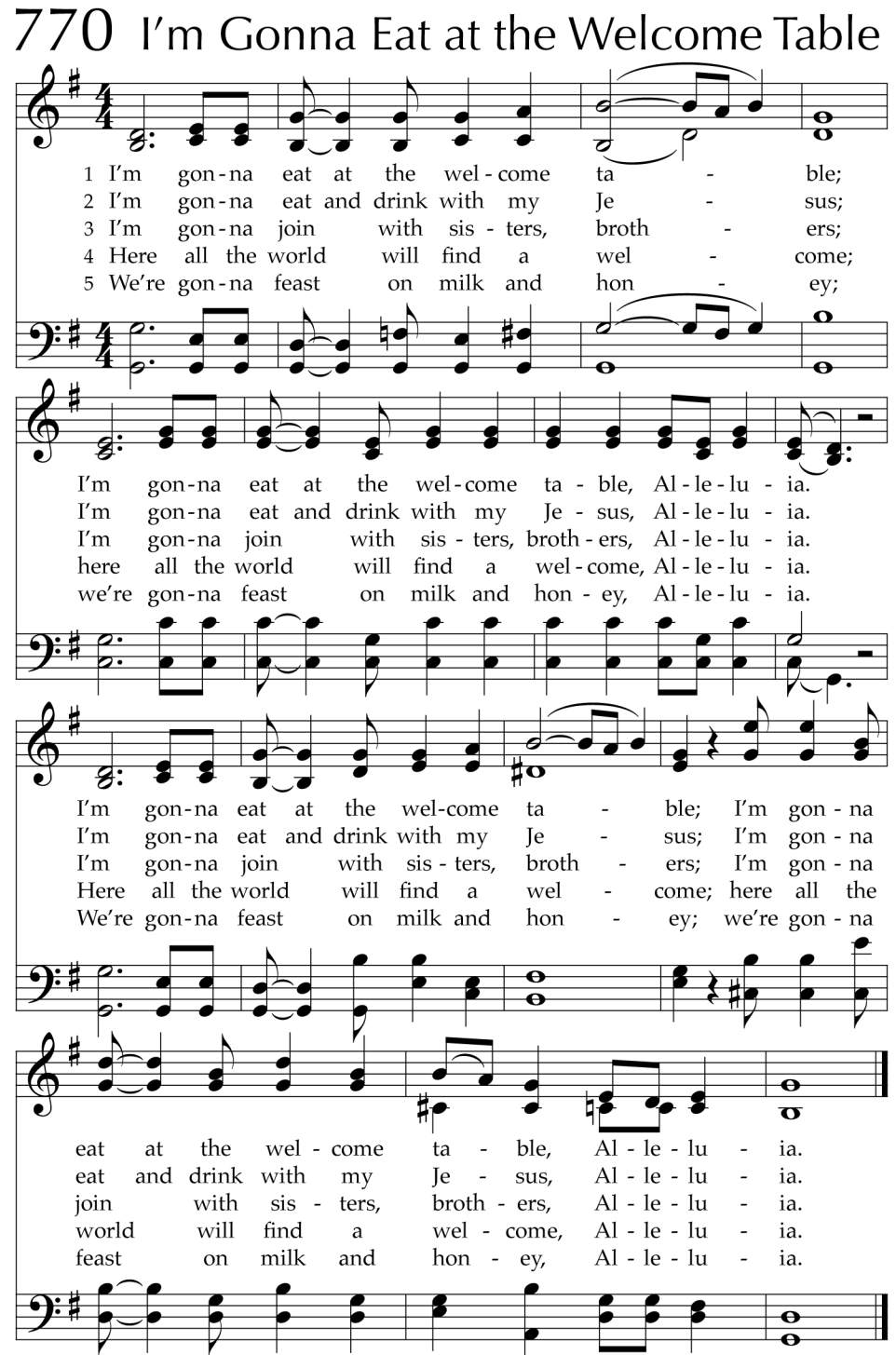
The image of a great feast showing God's welcome of all people was part of Jewish tradition (Isaiah 25:6–9) and underlies Jesus' parable of the Great Banquet (Luke 14:15–24). Such equality remains as unknown to many people today as it was to the slaves who created this spiritual.