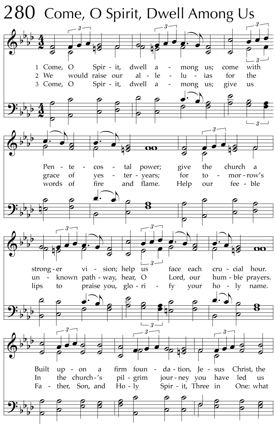
This 20th-century text was written by a Presbyterian layperson and poet, who in her later years became interested in writing hymns for the seasons of the church year and prepared a collection of them for her congregation. It pairs effectively with this sturdy Welsh tune.