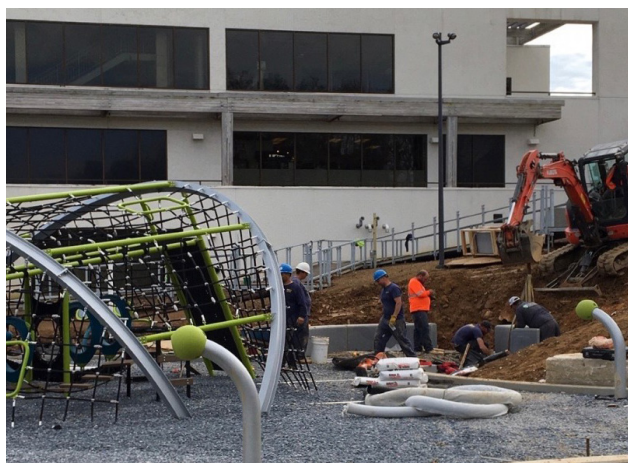
Playground being built in downtown Columbia, MD.